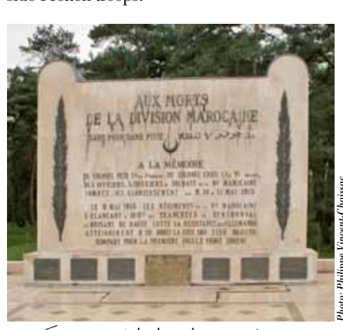
The memorial to the Moroccan Division

The 'case' in a Moroccan camp near fix - Noulette